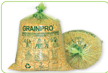
SuperGrainbag Farm Liner