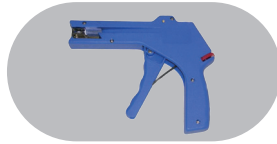
CABLE TIE GUN (sold separately)