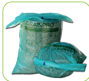
SuperGrainbag Premium 69RZ (with zipper closure)