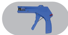
CABLE TIE GUN (sold separately for use with Premium RZ)