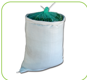
SuperGrainbag Premium 69RT Plus