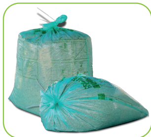
SuperGrainbag Premium 69RT