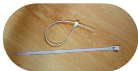
CABLE TIES (for closing SGB Premium RT)